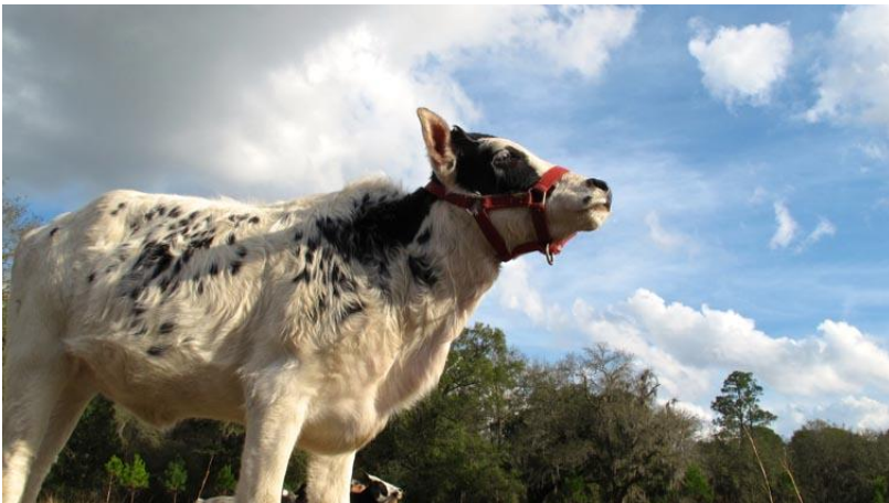
Yearling Heifer, Mayuri